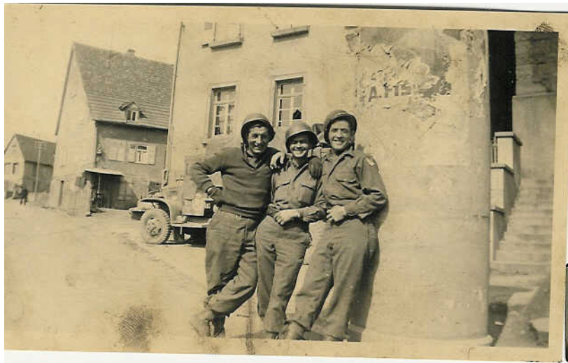
Hielbronn, Germany May 1945