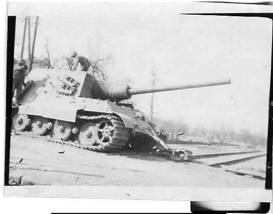
70 Ton Royal King Tiger Tank Sultz U. Wald February, 1945