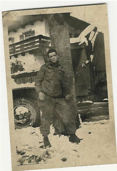
Fussen, Germany 5/45 We were staying in the house in the background and it sure was modern.