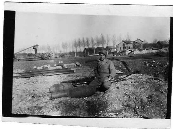
G.I. Joe beside a copule 500 lb. bombs. Germany 1945