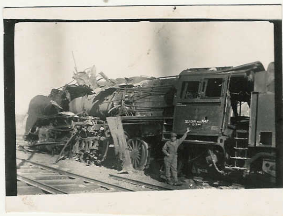
A hit on a locomotive. Souvenir of the R.A.F France, 1945