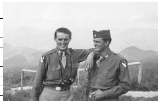
SIGHTSEEING AT "THE EAGLES NEST" JULY, 1945