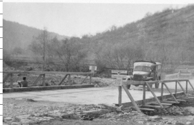
"LAST BRIDGE PROJECT!"