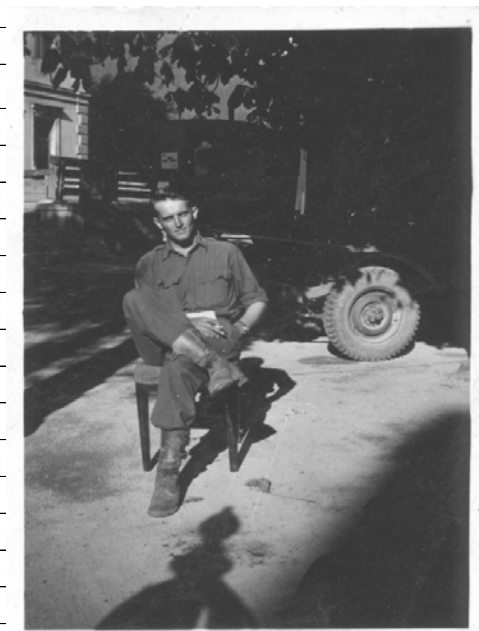
READING A LETTER FROM HOME